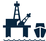
STACKING & MAINTENANCE